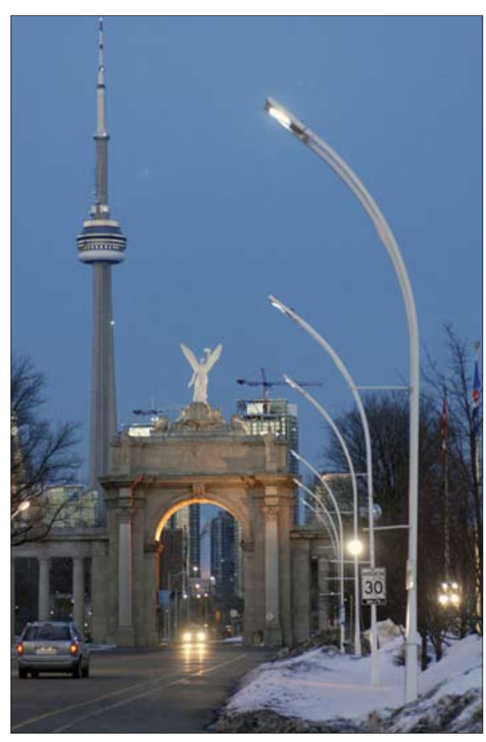
LED street lights illuminate Toronto's Exhibition Place.